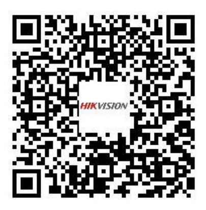
Figure 9-2 Device Command

Please scan the QR code below to view the device command document.