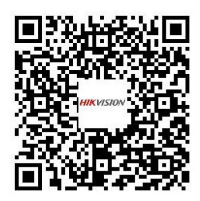
Figure 9-1 Communication Matrix

Please scan the QR code below to view the communication matrix document.